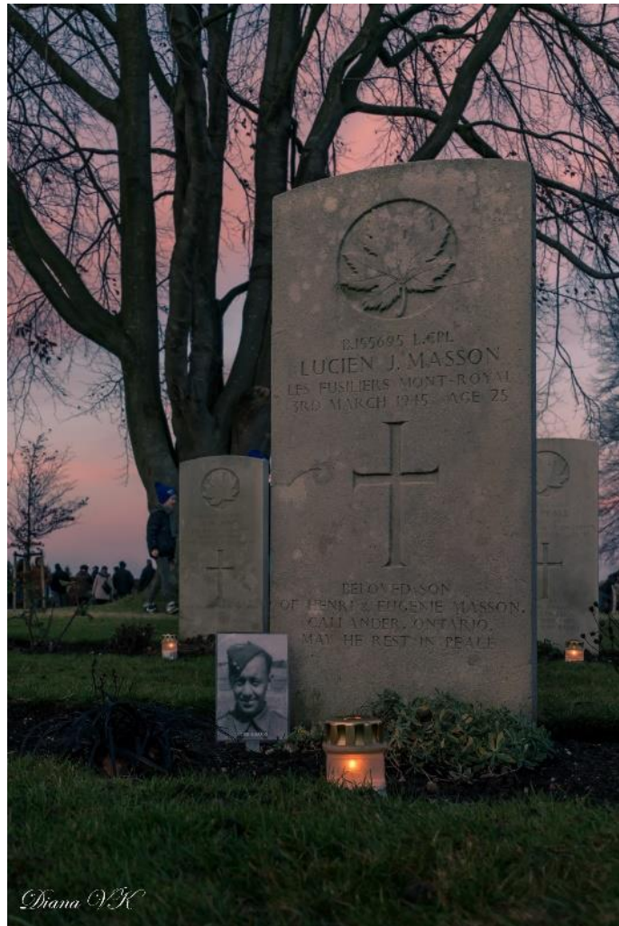
Candles Christmas Eve 24 December 2018.